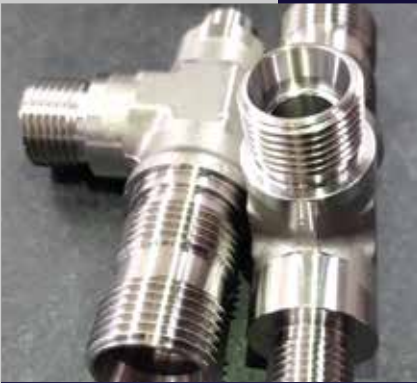
HIGH PRESSURE FITTINGS